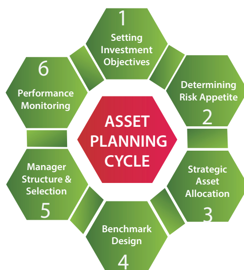
Asset Planning Cycle

Consequently, BSPCL has the advantage of understanding the market and can source the best rate for clients. The funds are placed with the financial institutions offering the best rate. Through consultation with you, BSPCL will chart the planned investment objectives, investment horizon, risk tolerance and expected returns. BSPCL translates the criteria into an investment strategy. Your portfolio will be monitored regularly to ensure that it remains consistent with your investment strategy. BSPCL will provide comprehensive reporting on the investment portfolio on a regular basis.